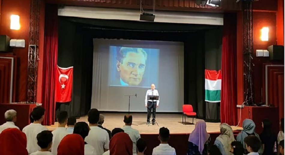
Figure 6. Farewell program to religious officers in DITIB Como

The event, attended by the Attaché, was also an occasion to present all the activities organized by the Como association in the past six years, stressing the COVID-related challenges, and to emphasize how they were in continuity with Turkey's long-lasting engagement vis-à-vis diaspora communities in Europe. In this view, the Turkish state's aim to not forget its citizens abroad and to preserve their belonging to the "Islamic civilization" ( Islam medeniyeti ) was operationalized through the building of mosques and cultural centers and the sending of religious officers from Turkey to Europe. In DITIB officers' speeches this notion of Islamic civilization is intertwined with national culture as an essential component of religion. This aspect is crucial in a migratory context considering that the DITIB is representing the Turkish Sunni interpretation of Islam, as the Attaché affirms: