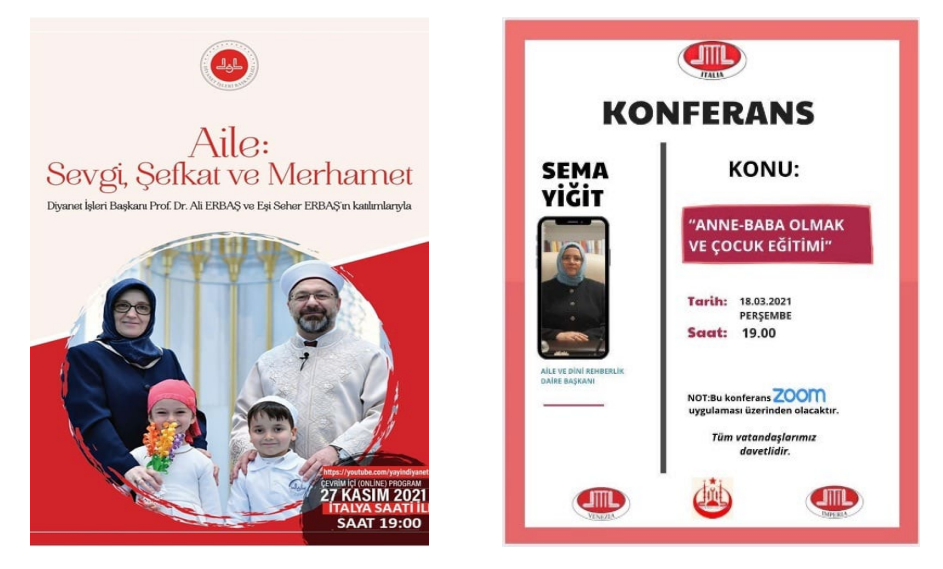
Figure 4-5. Posters of webinars on Family Relations ('Family: Love, Compassion and Mercy') and Parenthood ('Being Mother and Father, Raising Children'), with the participation of the DITIB president and his wife

The online seminars allowed the Diyanet to conduct activities despite the closure of mosques and religious centers worldwide and thus to strengthen Turkey's link to the diaspora also during COVID. From the vast number of online sessions organized between 2020 and 2022, it is clear that the emergency situation was used as a starting point to enhance programs on family and foster Muslim-Turkish belonging in different spheres of daily life. Not only were family life and routines indeed subverted by lockdown measures,