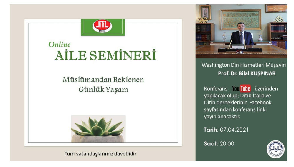
Figure 2. Poster of a webinar on Family, 'Daily life expected from a Muslim'

an important change in the city-based (often neighborhood-based) dimension, characterizing diaspora associations like the DITIB in which members usually know each other. The online meetings organized by the DITIB officers working in Italian branches were also welcoming people from abroad as in the case of the seminar titled "Daily life expected from a Muslim" in which the religious advisor in Washington intervened, who operates within the framework of Diyanet America (Figure 2). The online seminars were either attended or organized by people from Germany, US, New Zealand, and Turkey, allowing for an expansion of the communities beyond the city borders.