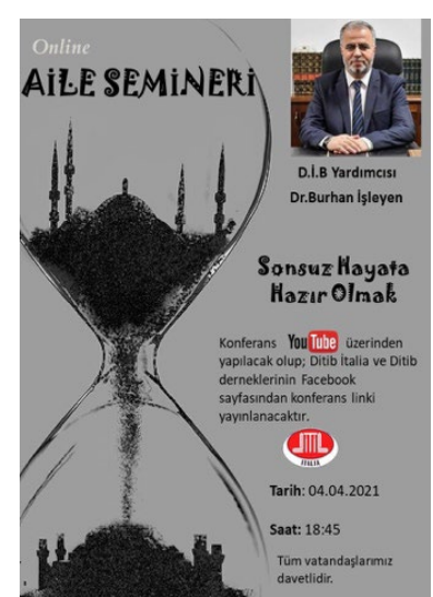
Figure 3. Poster of a webinar on Family, 'To be ready for eternal life'

Conference titled "Being Mothers and Fathers, Raising Children" hosting Diyanet's Head of the Department of Family and Religious Guidance (Figure 5).